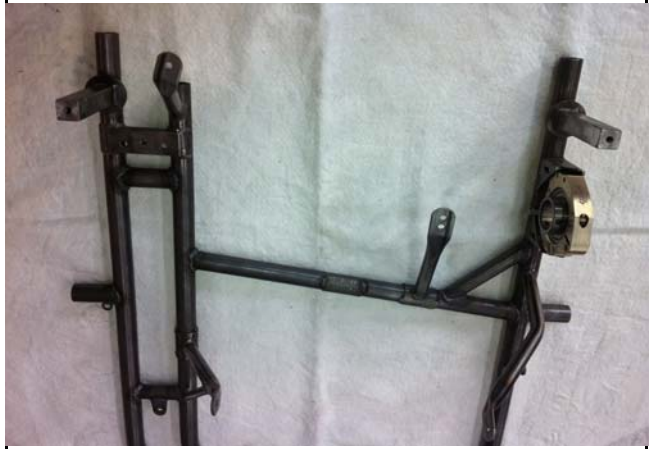
Photo from above of the frame with the section of the two supports for the exhaust system