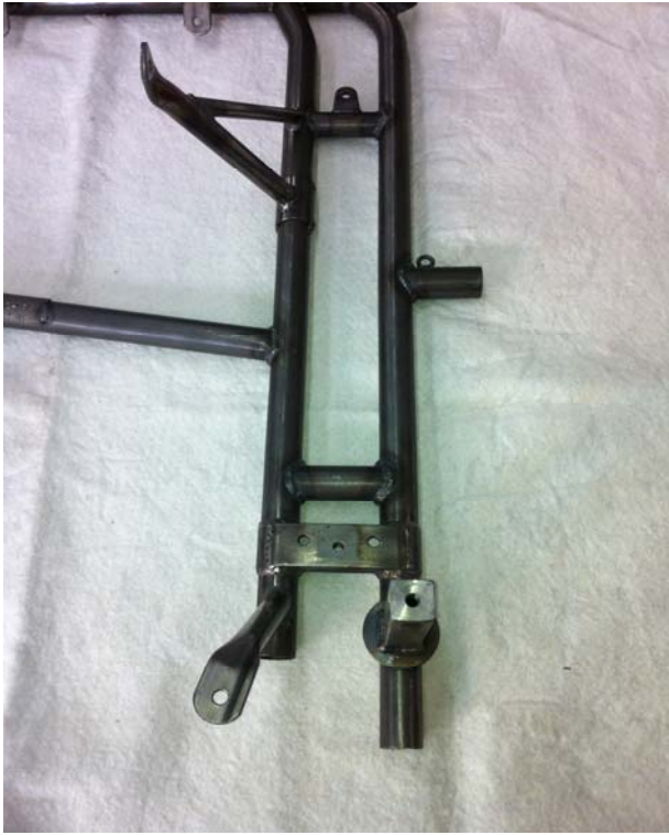
Photo from above of the frame with the section of the engine mount