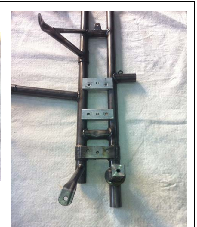
Photo of the frame from the back with the section of the support for the RTPS (Rear Tire Protection System)