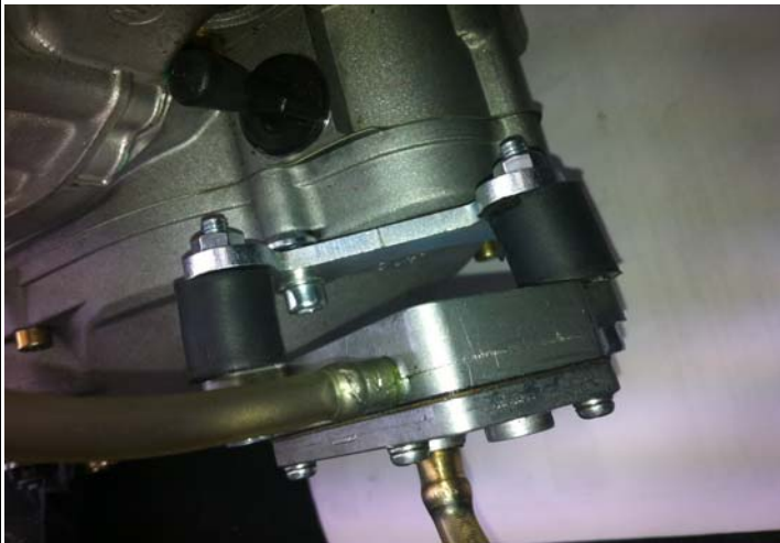
Foto of the frame with the section of the support for the fuel pump (fuel pump mounted)