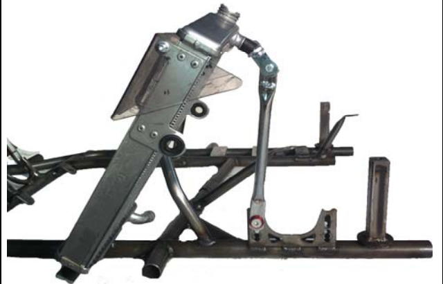
Foto of the frame from the side with the section of the supports for the radiator (radiator mounted)