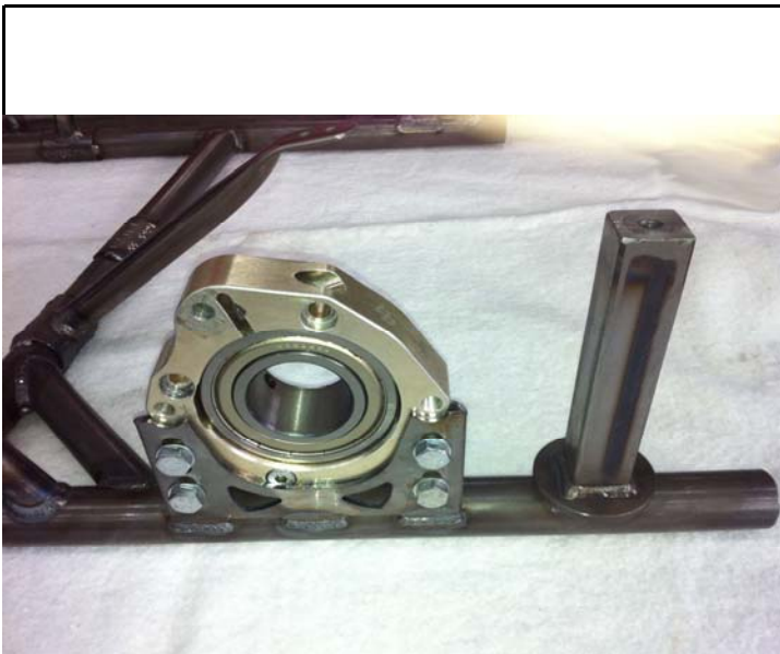
Photo of the frame from the side with the section of the support for the RTPS (Rear Tire Protection System)