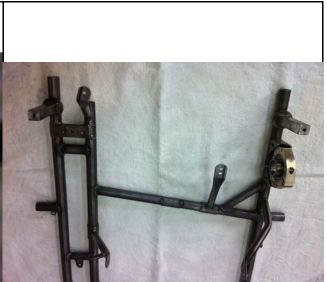
Photo from above of the frame with the section of the two supports for the RTPS (Rear Tire Protection System)